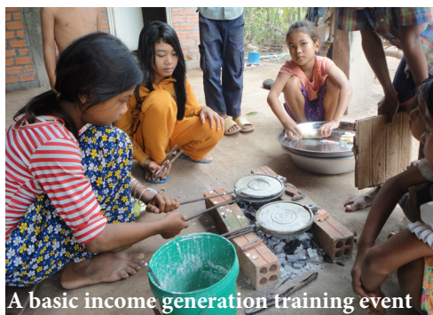
A basic income generation training event

Youth on the Move works to increase the effectiveness of local services for vulnerable youth over the long term through teacher, school management and institutional capacity building, more relevant curricula, improved monitoring and evaluation systems, and engagement with the government at various levels. There are direct linkages to, and support for, implementation of relevant government policies, such as those on life skills, Student Councils, ICT, and the 2011 National Policy on Cambodia Youth Development. With support and training from World Education, all on-the-ground interventions are managed by either youth groups, student councils or working groups made up of those with official mandates for protecting and educating youth in target communities.