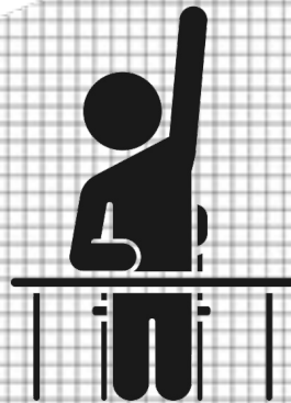
Component 3 Improved School Management and Community Engagement