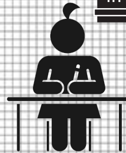
Component 4 Educational Relevance