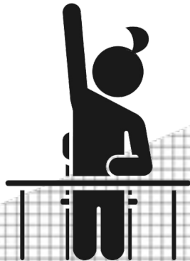
Component 1 Capacity Building

Program Objective: Increased Relevance, Quality, and Access in Basic Education