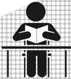
Component 2 More Equitable School Access